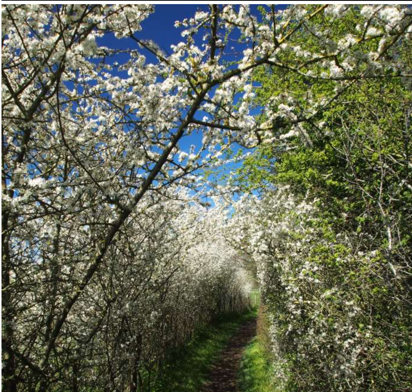
Tunnel of Blackthorn (on the footpath to Coombe Bissett)